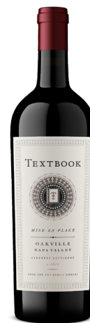
MISE EN PLACE CABERNET OAKVILLE