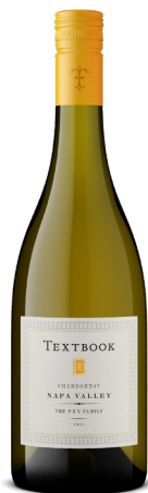
CHARDONNAY NAPA VALLEY