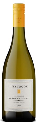
CHARDONNAY SONOMA COUNTY