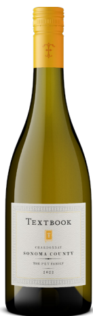
CHARDONNAY SONOMA COUNTY