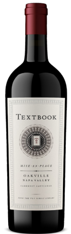
MISE EN PLACE CABERNET SAUVIGNON OAKVILLE