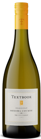
CHARDONNAY SONOMA COUNTY