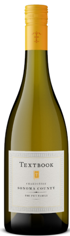
CHARDONNAY SONOMA COUNTY