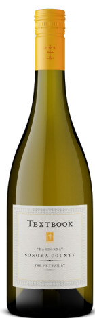
CHARDONNAY SONOMA COUNTY