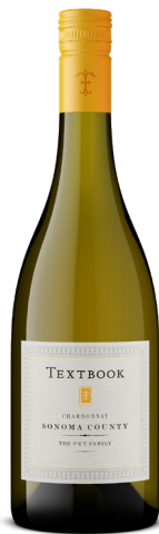
CHARDONNAY SONOMA COUNTY