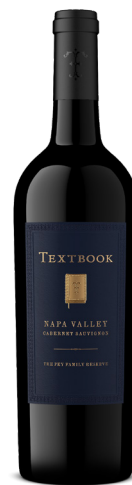
RESERVE CABERNET SAUVIGNON NAPA VALLEY