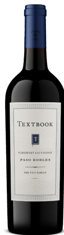
CABERNET SAUVIGNON PASO ROBLES