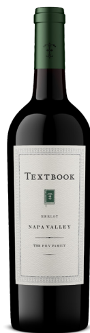
MERLOT NAPA VALLEY