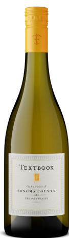
CHARDONNAY SONOMA COUNTY