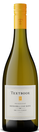
CHARDONNAY SONOMA COUNTY