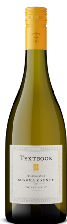
CHARDONNAY SONOMA COUNTY