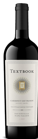
YOUNTVILLE CABERNET SAUVIGNON